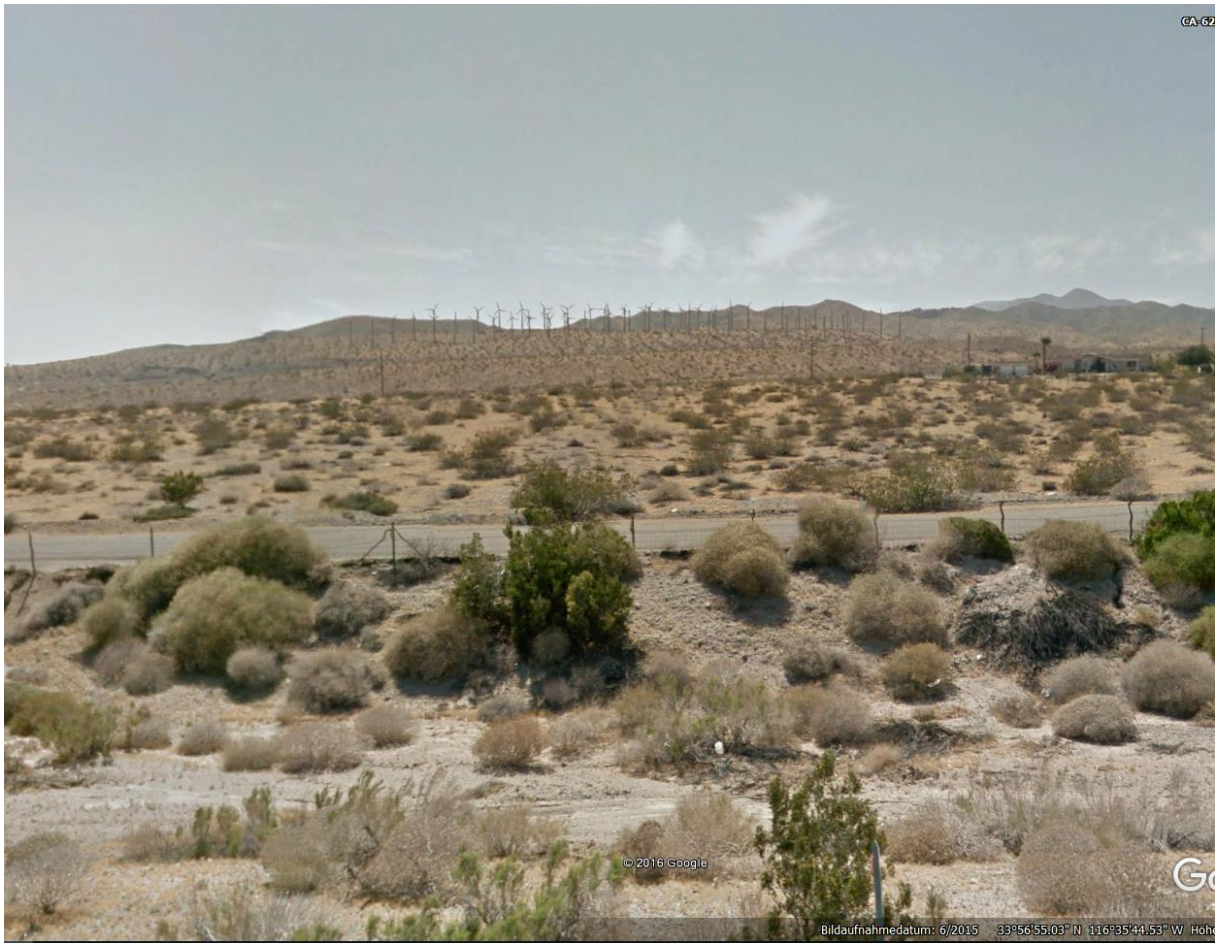
Ausgedehnte Windparks beidseits