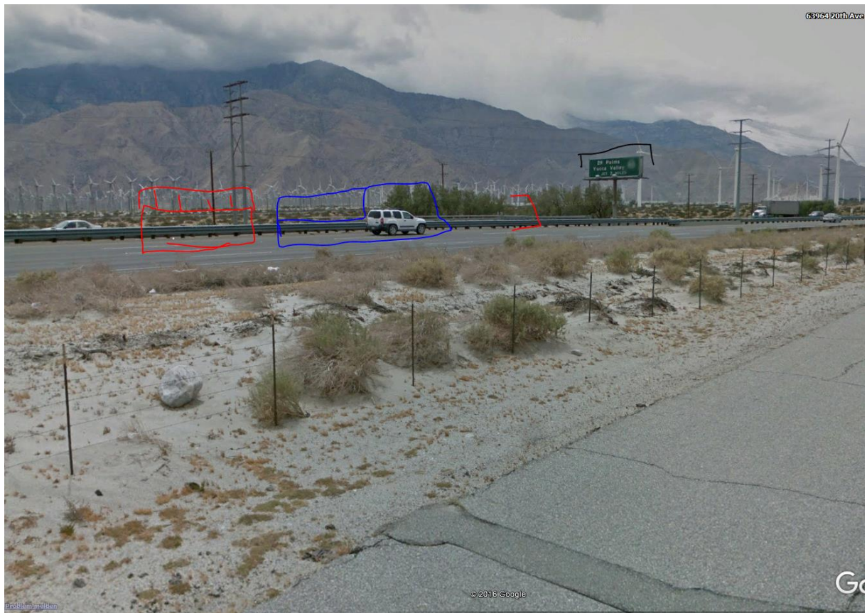
Ungefähre Stellung der Fahrzeuge bei Kollision, Strassenschild aus Unfallfotos