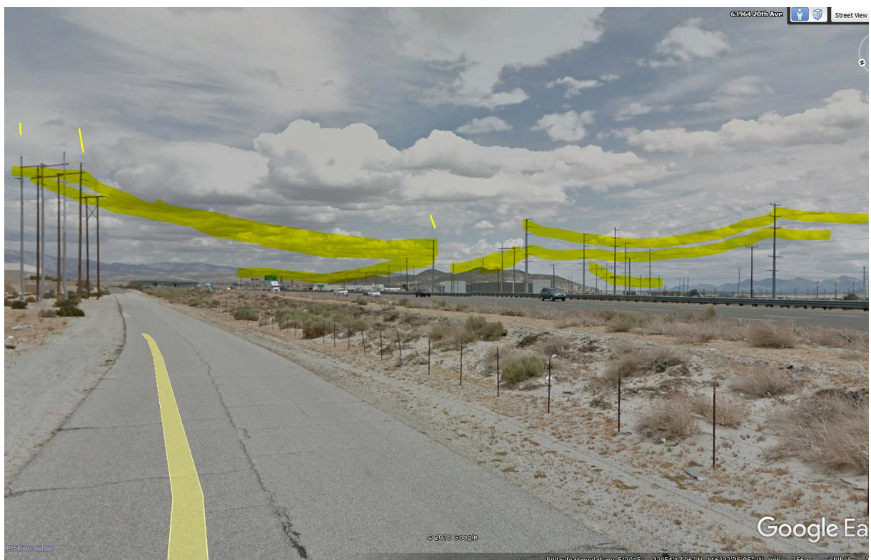
Oben: Querung aus Parallelstrasse südwestlich