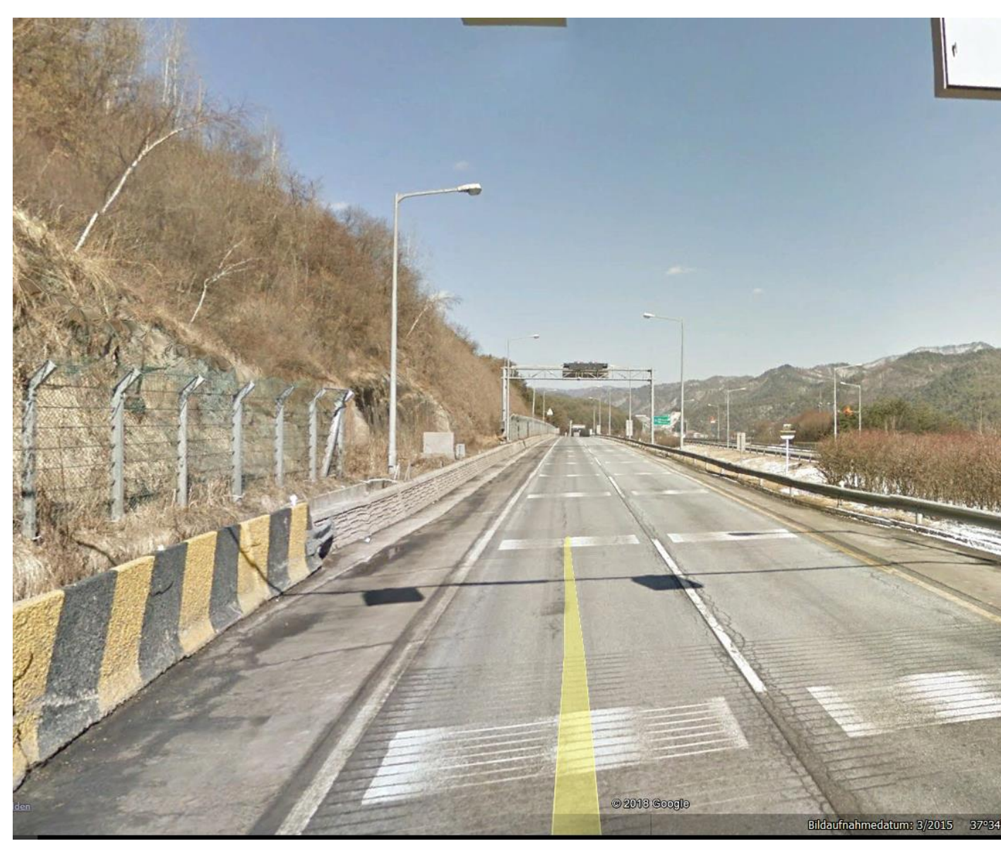
Im Video sind die Signalbrücke, die kleine Schaltanlage, die grössere Elektro-Schaltbox, der Mast und der Zaun zu sehen. Die grüne Struktur links im Hintergrund ist ein im Sommer überwachsener Zaun.