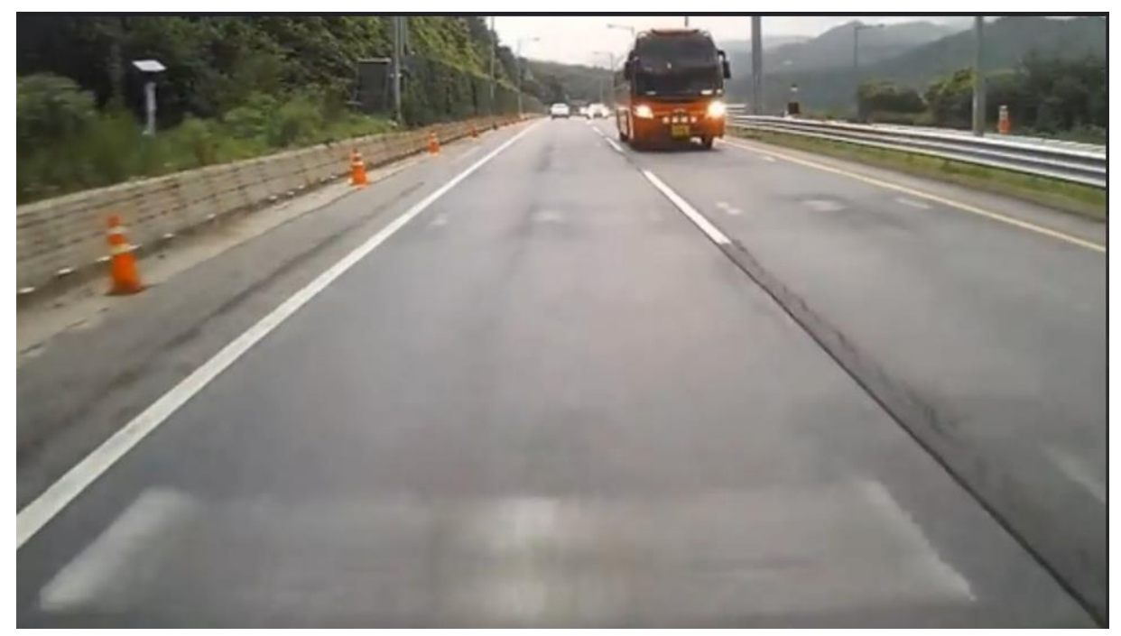
The bus speeds down the highway appearing to be fully under controlImage: YOUTUBE

But the driver fails to see a queue of traffic in front of him - and rips through the first car it hits Image: YOUTUBE